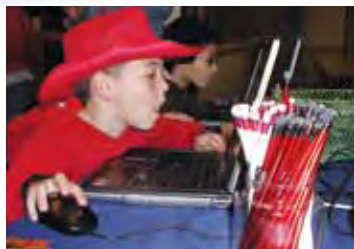
NET at Fontenelle Forest

More than 1,500 kids and parents attended Spring Free Family Day on April 19 at Fontenelle Forest, where they visited NET's booth to explore the new NET Kids Web site. NET gave away USB bracelets loaded with PBS Kids games and activities.